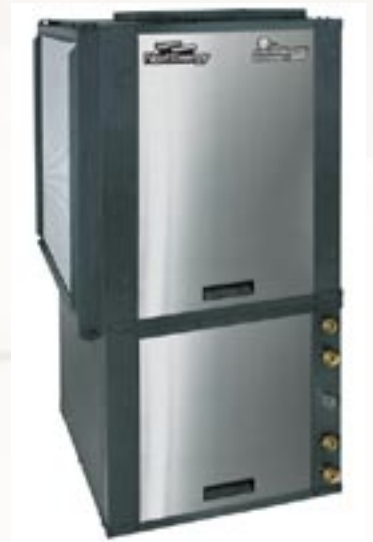
Tranquility 20™ Unit

What can you do to protect your family from this costly trend? Reduce your consumption of energy. You can improve your home's 'energy efficiency' with better appliances, more insulation, and newer or fewer windows...but did you know that over 50% of your utility costs come from heating, cooling, and hot water? Now that's something you can control...it's called the Tranquility20™ geothermal system from NextEnergy.